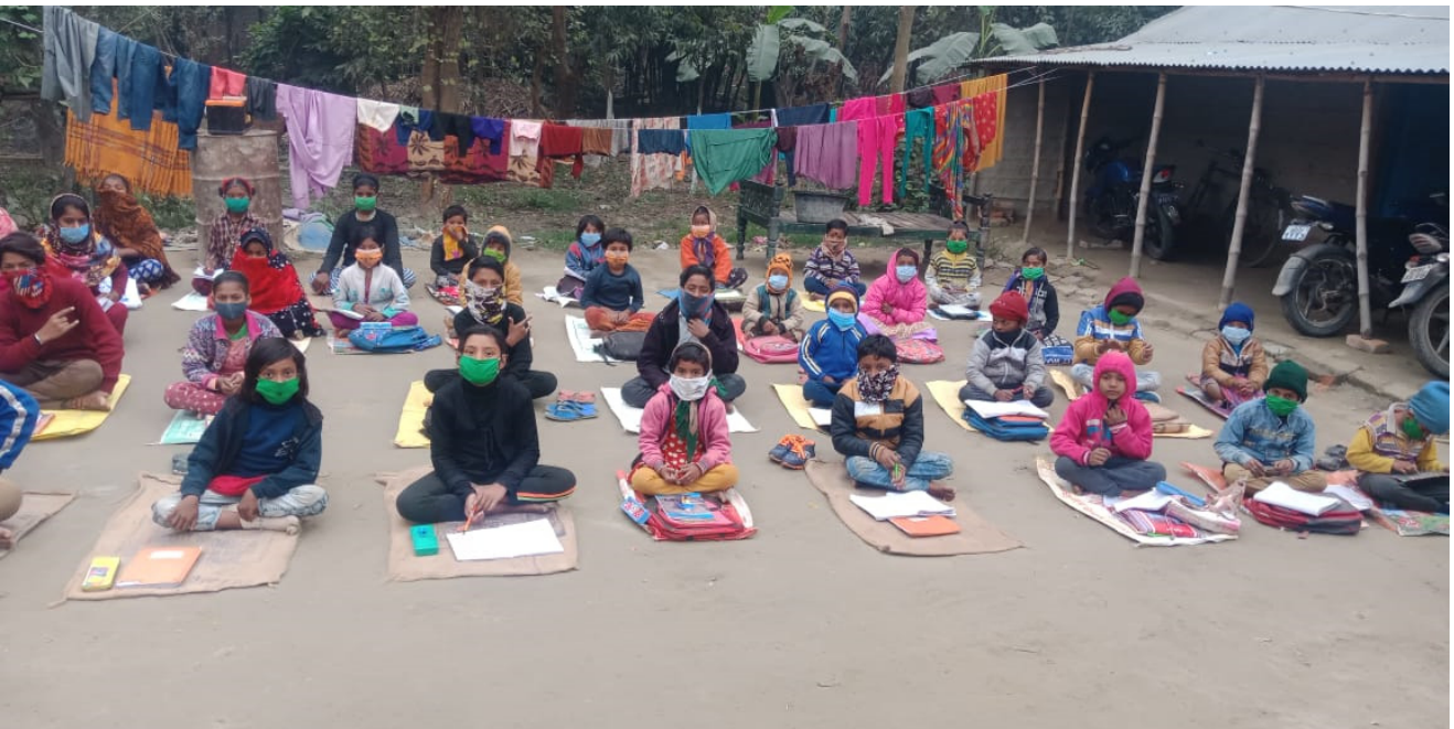
Students are learning while observing the COVID-19 safety protocols—here each student wears a mask, and each is socially distanced from their neighbor.