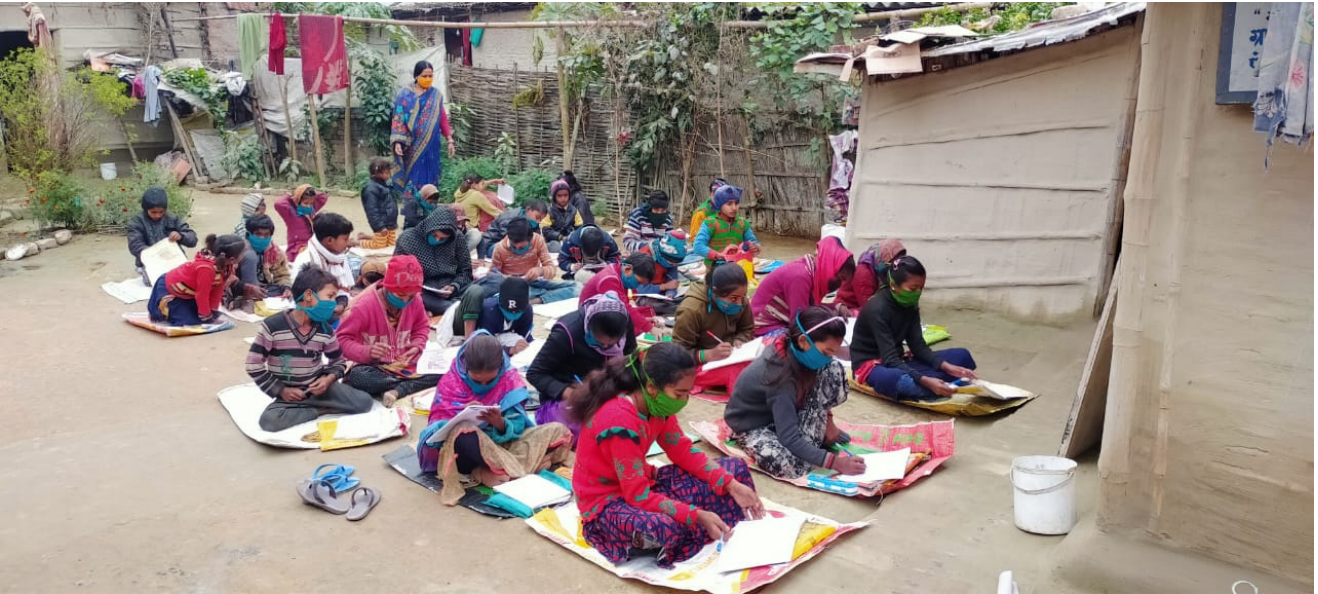
Despite all of our Free Schools being closed for much of 2020 (March to December), classes recommenced in the second week of January following strict COVID-19 protocols.